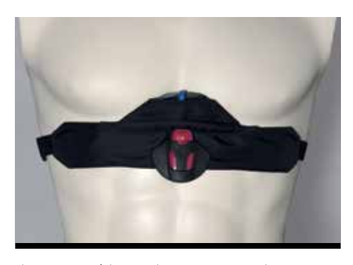
The prototype of the EKG chest strap was tested on various test subjects in more than 100 experiments.

sion are also needed. The scientists are currently working on this. Moreover, the researchers are already considering the extent to which the electrodes could be used for other purposes – such as to stimulate muscles in pain therapy or reactivate the colonic function in bedridden patients using interference wave therapy, for instance. //