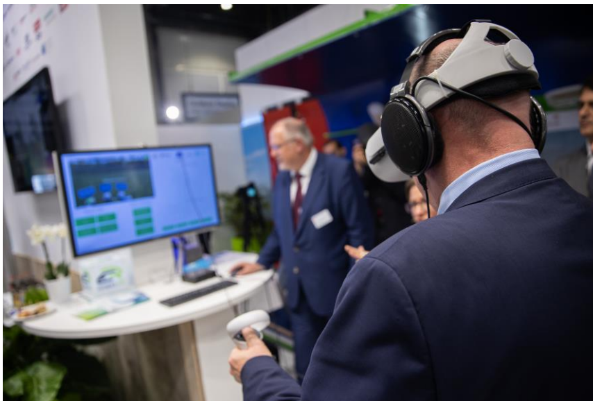
Figure 1: Live demonstration of the new SILVARSTAR Auralisation and VR tools at InnoTrans 2022 in Berlin at the Europe's Rail exhibition booth, with the EU Directorate-General for Mobility and Transport Henrik Hololei using the VR system.

The following two sections briefly introduce the two new software tools.